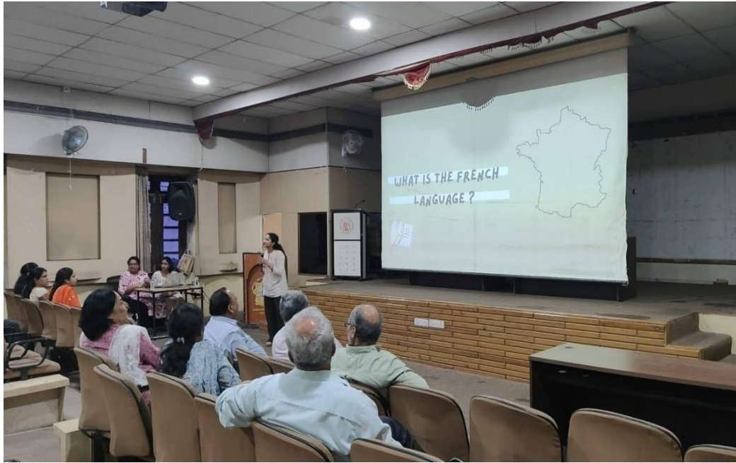
Figure: Expert talk on French Language