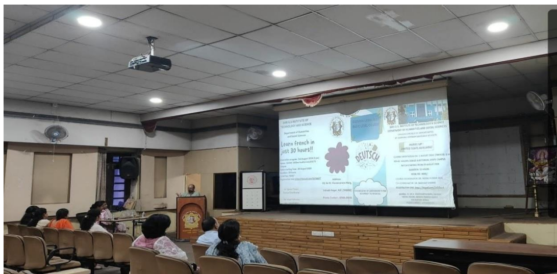
Figure: Introduction to French Language